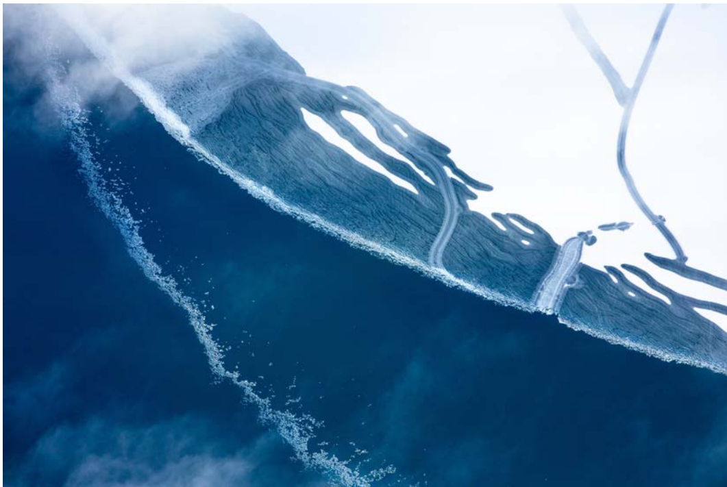
TUCK FAUNTLEROY, ELEMENTS III , 2019, ARCHIVAL PIGMENT PRINT, 50 X 75 IN.